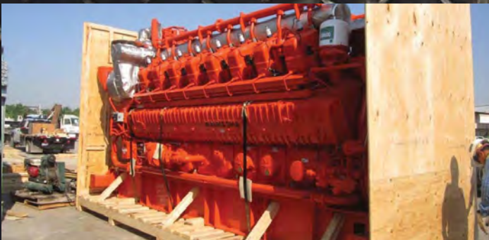
Export Packing and Crating