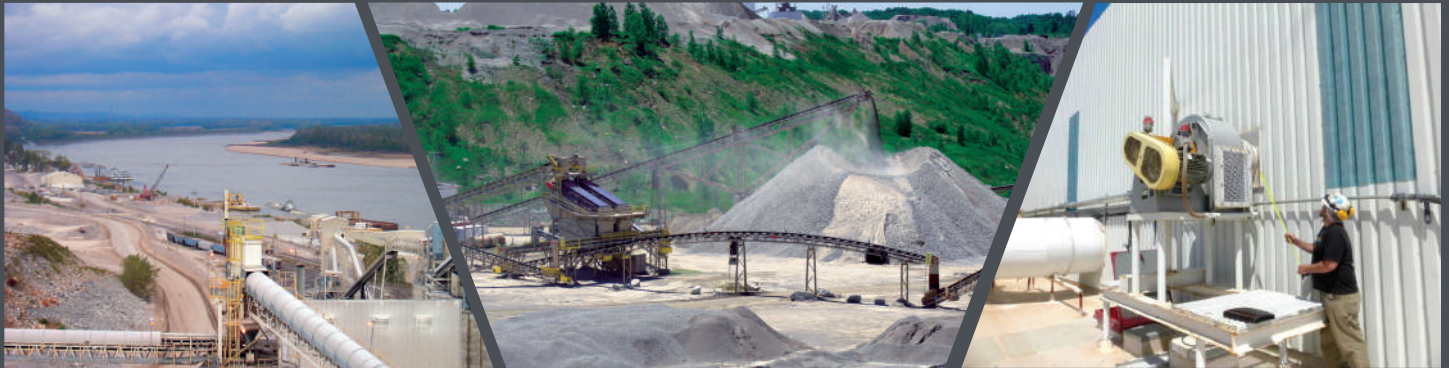
1: As part of the air permit requirements, stack testing is performed at this lime plant in Ste. Genevieve, MO.

CEC evaluates the possible effects of mining on streams and wetlands and designs plans to mitigate impacts. Biological monitoring services can be implemented to develop cost-effective variances to permit requirements, reducing facility operation or construction costs.