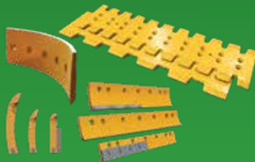
Scraper Cutting Edges Motor Grader Blades End Bit Motor Grader