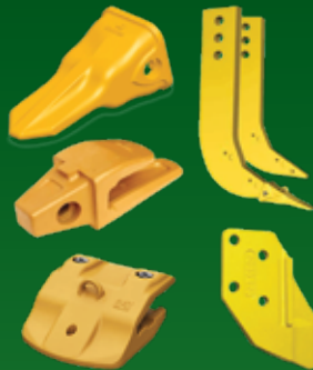
Bucket Teeth Adaptors Lip Shrouds Side Cutters Ripper Shanks