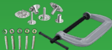
Fasteners Pins and Retainers Clamps